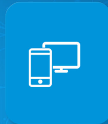
Media & Entertainment