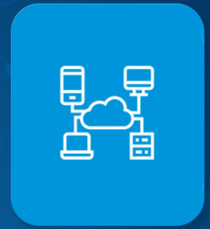
Internet Service Provider