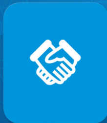
Trading & Logistics